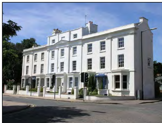
Nos.9-11 Spencer Parade (1838); a row of three houses designed to read as a single composition

East of the churchyard is a fine row of three early 19 th century houses (Nos 9-11 Spencer Parade), built in classical style, stucco, with shallow front gardens and low walls. Only one remains in residential use with the remaining two converted for business purposes. The properties are characterised by their attention to detail with canted bays, sash windows and elegant iron canopy porches and are listed in grade II. Former service buildings to the rear, some of which are set into the churchyard wall, are important and should be retained.