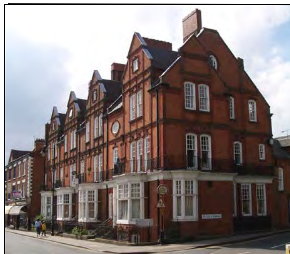
Nos. 81-87 St Giles' Street (grade II listed)

Only the eastern section of St Giles' Street is within the Conservation Area. The north side consists of a group of buildings, many of which are listed, which make an important contribution by virtue of their elegance, detailing and sense of place in the street scene. It is dominated by an elegant row of three-storey red brick houses dating from 1883 (Nos. 81-87 St Giles' Street), designed in Carolean style by the notable Northampton architect Matthew Holding.