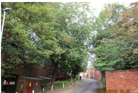
Spring Gardens, looking north

8.4 Trees on the west side of Spring Gardens are important in views along the lane and help to soften the visual dominance of the telephone exchange building (below).