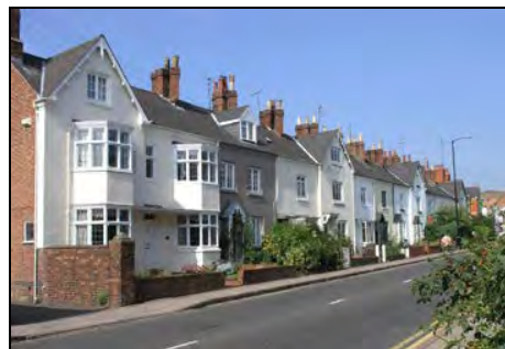
Nos.1-12 York Road, formerly named Victoria Terrace (grade II listed)

York Road is lined on both sides by attractive Victorian terraced properties, most of which are still in residential use. The south-western terrace (Nos.1-12 York Road) is listed and gives a balanced and visually pleasing view from the junction of Billing Road; the decorative chimney stacks are an attractive feature.