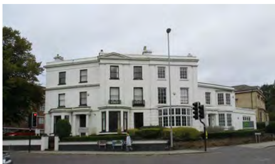
Former villas at the southern end of Cheyne Walk emphasise the quality of residential properties built in the area in the mid-19 th century

The west side of Cheyne Walk is dominated by substantial villas on large plots, built around 1840 in Regency neo-Classical or Italianate style. The properties formed a continuation of the high-class residential area along Spencer Parade and the two roads comprised some of the finest houses in the town in the mid-19 th century. The elevated position gave open views across the Nene valley, which lasted until the 1930's when the land opposite was developed to facilitate hospital expansion. Nos.2 to 5 Cheyne Walk were originally set back and faced onto a crescent.