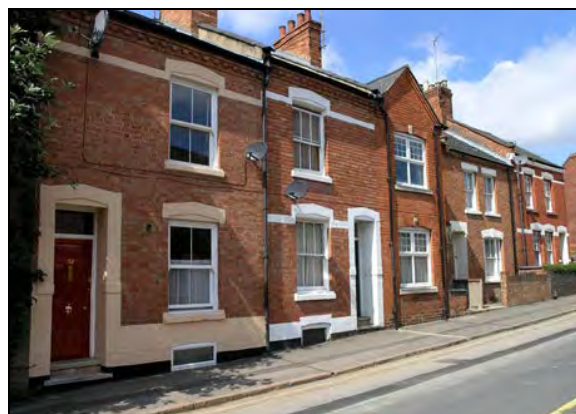
Mid-19 th century housing on Spring Gardens

Spring Gardens is a narrow lane linking St Giles' Street and Derngate and is a quiet backwater. At the north end is a small group of Victorian houses which reflect the original residential character of the area and which retain most of their architectural details. The lane was formerly lined with a row of similar properties and the remaining few make a positive contribution to the area that justify their inclusion in the Conservation Area in 2006.