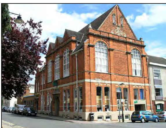
The former St Giles' Church building is a prominent landmark at the entrance to the Conservation Area .

Hazelwood House, on the corner of St Giles' Street and Hazelwood Road, was built as the St Giles's Church Buildings in 1889, also by Newman, in Renaissance style with attractive large sash windows on the first floor; the ground floor is in retail use. The building was included within the Conservation Area as part of the 2006 review on account of its contribution to the character of the area.