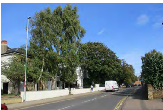
The importance of trees and greenery in views along Cheyne Walk.

8.3 The surviving front gardens of former villas fronting Cheyne Walk and Spencer Parade create an interesting composition of buildings set in their own grounds. The properties are generally well set back into the plot and are surrounded by boundary walls and planting to create a visual separation between the private and public environment. Trees and greenery along Cheyne Walk in particular make an important contribution to the appearance of the area.