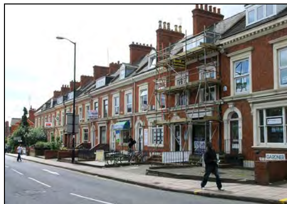
Late 19 th century terraced houses on York Road