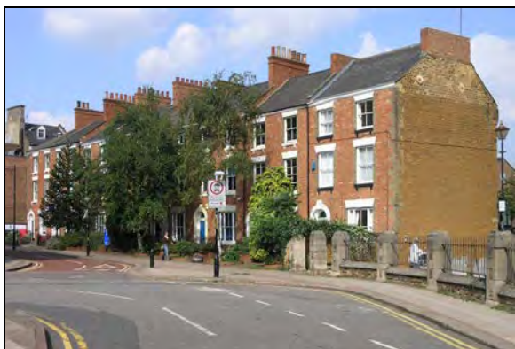
Nos. 1-8 St Giles' Terrace (grade II listed)

from the peaceful atmosphere of St Giles' to the busy shopping area of Abington Street; the bend in the road creates added interest.