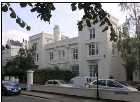
Tudor- style villas at 1-3 Spencer Parade

There is a particularly fine view into the Conservation Area from the junction with York Road that emphasises the quality of the buildings in the area.