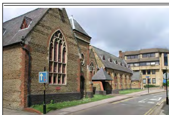
Former St Giles's Church School, now the church centre

St Giles' Terrace links St Giles' Street and Abington Street. The southern half of the street is dominated by St Giles' church and the former school opposite, built in Gothic style between 1858-61 by E F Law, one of the most prominent of Northampton's Victorian architects.